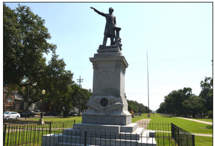
JEFFERSON DAVIS MONUMENT