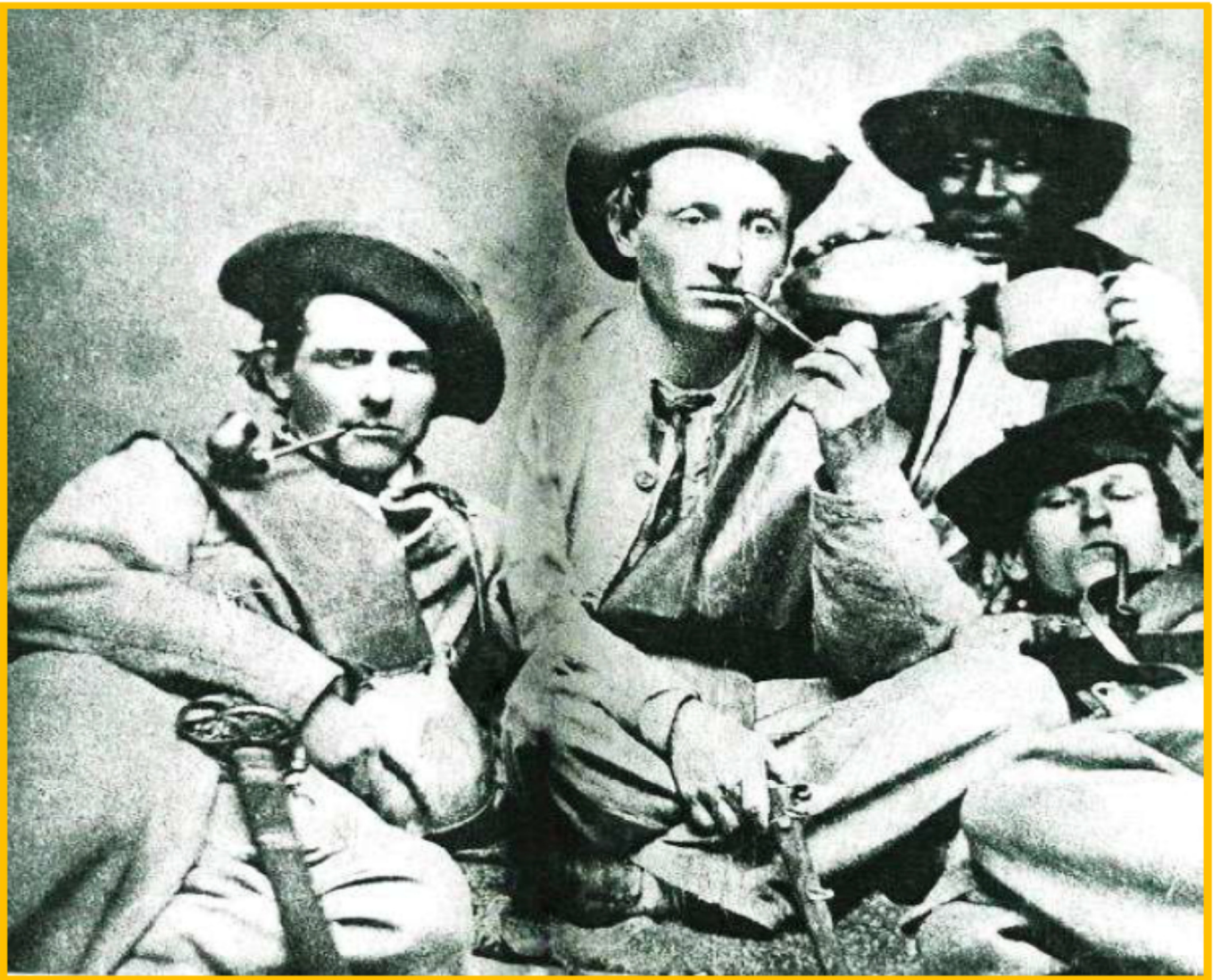
Cavalry troopers. Not only are there black Confederate soldiers, here's proof positive they were integrated, unlike the North.

T he words of Irish-born Confederate Major General Patrick Cleburne from his January 1864 letter, proposed the mass emancipation and enlistment of Black Southerners into the Confederate Army, his words are both profound and very accurate, "Every man should endeavor to understand the meaning of subjugation before it is too late...It means the history of this heroic struggle will be written by the enemy; that our youth will be trained by Northern schoolteachers; will learn from Northern school books their version of the war; will be impressed by the influences of history and education to regard our gallant dead as traitors, and our maimed veterans as fit objects for derision...The conqueror's policy is to divide the conquered into factions and stir up animosity among them... ..It is said slavery is all we are fighting for, and if we give it up we give up all. Even if this were true, which we deny, slavery is not all our enemies are fighting for. It is merely the pretense to establish sectional superiority and a more centralized form of government, and to deprive us of our rights and liberties-Major General P. Cleburne." Now you have some of the evidence, you decide...but don't shun any veterans simply because they had a different skin colour.