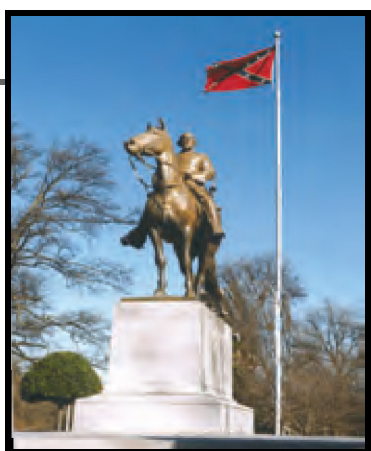
Forrest Statue at Forrest Park is on top of the General's and his wife's tomb.