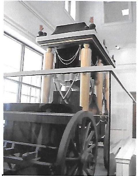
Jefferson Davis catafalque, a ceremonial platform used to carry the remains of Jefferson Davis in the 1889 funeral procession is on display in the Confederate Museum at Beauvoir.

Less than four years later, in May, 1893, Jefferson Davis was removed from the tomb in Metairie Cemetery, and a special train furnished by the L & N Railroad carried his body to Richmond Virginia. Huge crowds and flowers marked the course of the train as it wound its way across the South. He rests today in Hollywood Cemetery, surrounded by his family. It is appropriate that his final resting place be in the city of his greatest labor as the only President of the Confederate States of America.