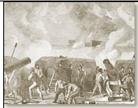
Firing on Fort Sumter From a contemporary illustration.

Lincoln learned that the garrison at Fort Sumter was in trouble on the day he took office in March 1861. The garrison was running out of food and supplies and had no way of obtaining these on shore. The President ordered a relief expedition to sail immediately and informed the Governor